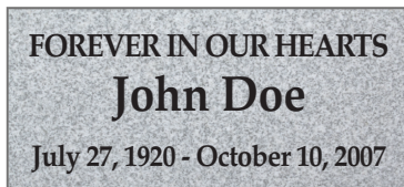
Terms / Name / Dates